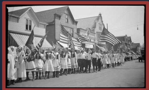
Photo history will focus on ethnic settlements

Urban Anthropology Inc. has created this historic publication on the Milwaukee area originally settled by the Poles. The book is part of Arcadia Press' Images of America series. Including nearly 200 photographs, the volume tells the story of the various ethnic migrations to the area, which resulted in a community of 110 nations today.