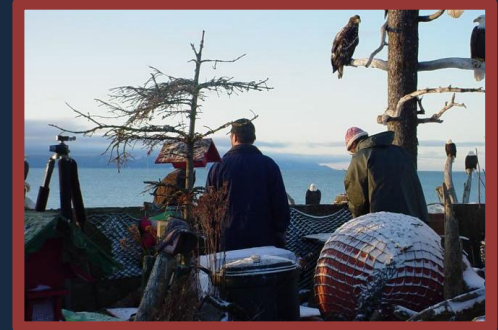
Parishioners caring for endangered eagles

The Congregation of the Great Spirit is a Catholic church that incorporates Native American traditions into the weekly mass. The church supports and maintains the Sigenauk Center which is in the old Rectory of the church property. The Sigenauk Center houses a food and clothing bank which is open every Thursday at 1:00 to 3:00 pm, and every Friday 10:00 am to noon. The clothing bank is open during these hours too.